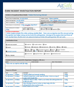
Incident Investigation Form