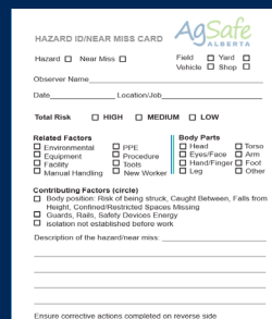
Hazard ID Form